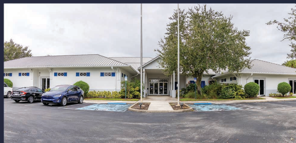
PGA West Church and Middle School

"The Church Renewal Lab helped us identify what was really going on in our church, and they helped us gain the traction we needed to get out of the rut. We were able to understand what church health is about. The practices of the Renewal Lab led us to this foundation of dependency on God"