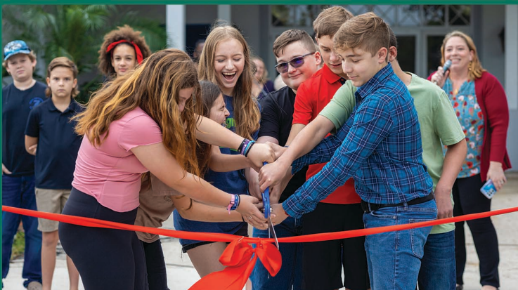
8th grade class cutting the ribbon at our new PGA West Middle School campus

God's providence has surpassed all of our hopes and dreams in 2023. We were blessed to open not one, but two new campuses, bringing our total to four locations of Christ-centered learning. Our middle schoolers settled into our PGA campus the week before Christmas break. They participated in our first annual "Spiritual Emphasis Week" centered on strengthening their relationships with Christ.