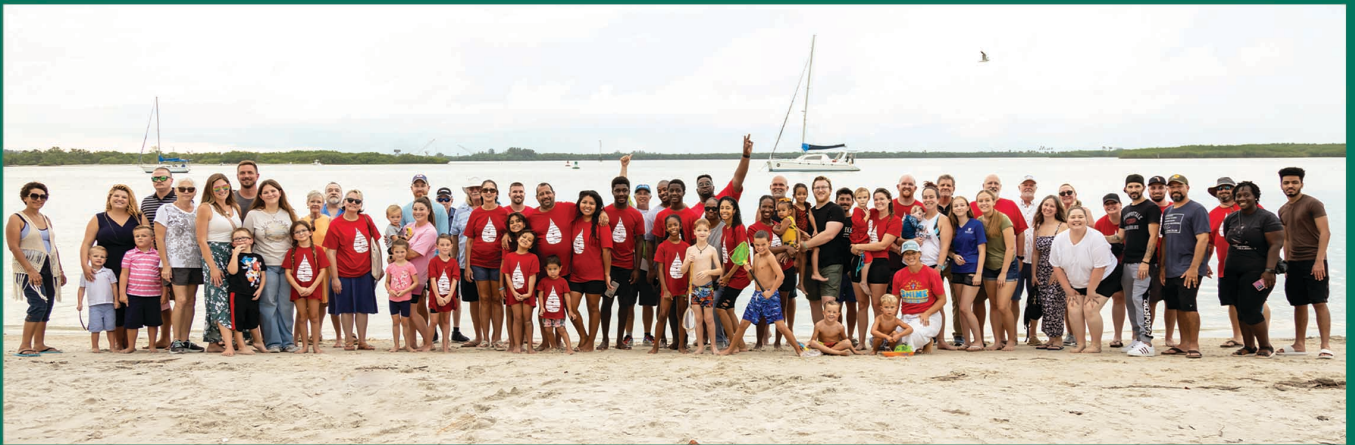
Bi-annual beach Baptism. 18 people gave their lives to Christ this past Fall.

In our pursuit to expand our outreach, we initiated a new worship service in a local nursing home, established a jail ministry worship service, and launched three new campuses across Florida. Our commitment to community service has enabled us to assist over 800 families by providing food for those facing food insecurity. This is in addition to addressing weekly benevolence requests to support individuals in our local community.