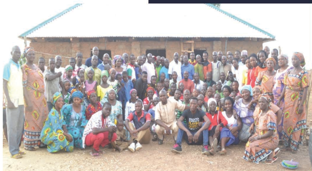
Nigerian Church Plant

By God's grace, we were also able to plant two more churches in Nigeria, bringing the total there to 11.